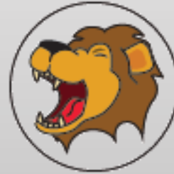
Rumble in the Jungle