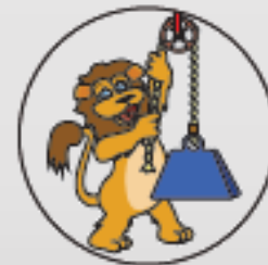
Gizmos and Gadgets