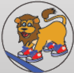
On Your Mark