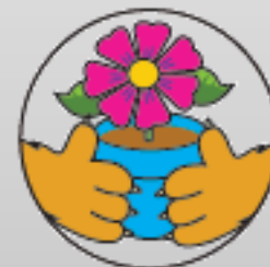
Ready, Set, Grow