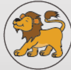
I'll Do It Myself