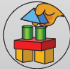
Build It Up, Knock It Down