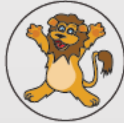
Fun on the Run