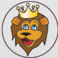
King of the Jungle