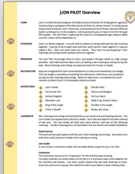
1-Page Program Overview