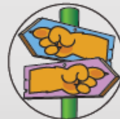
Pick My Path